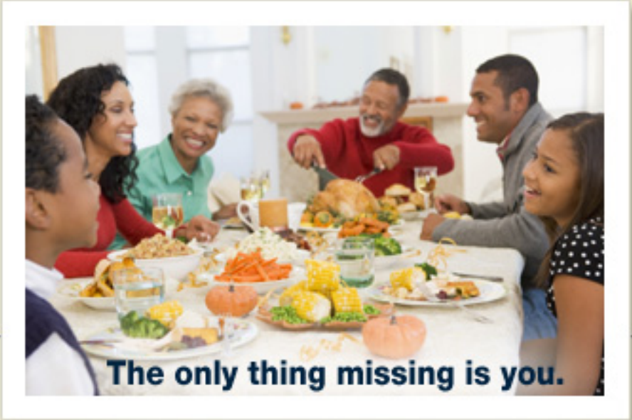
The only thing missing is you.